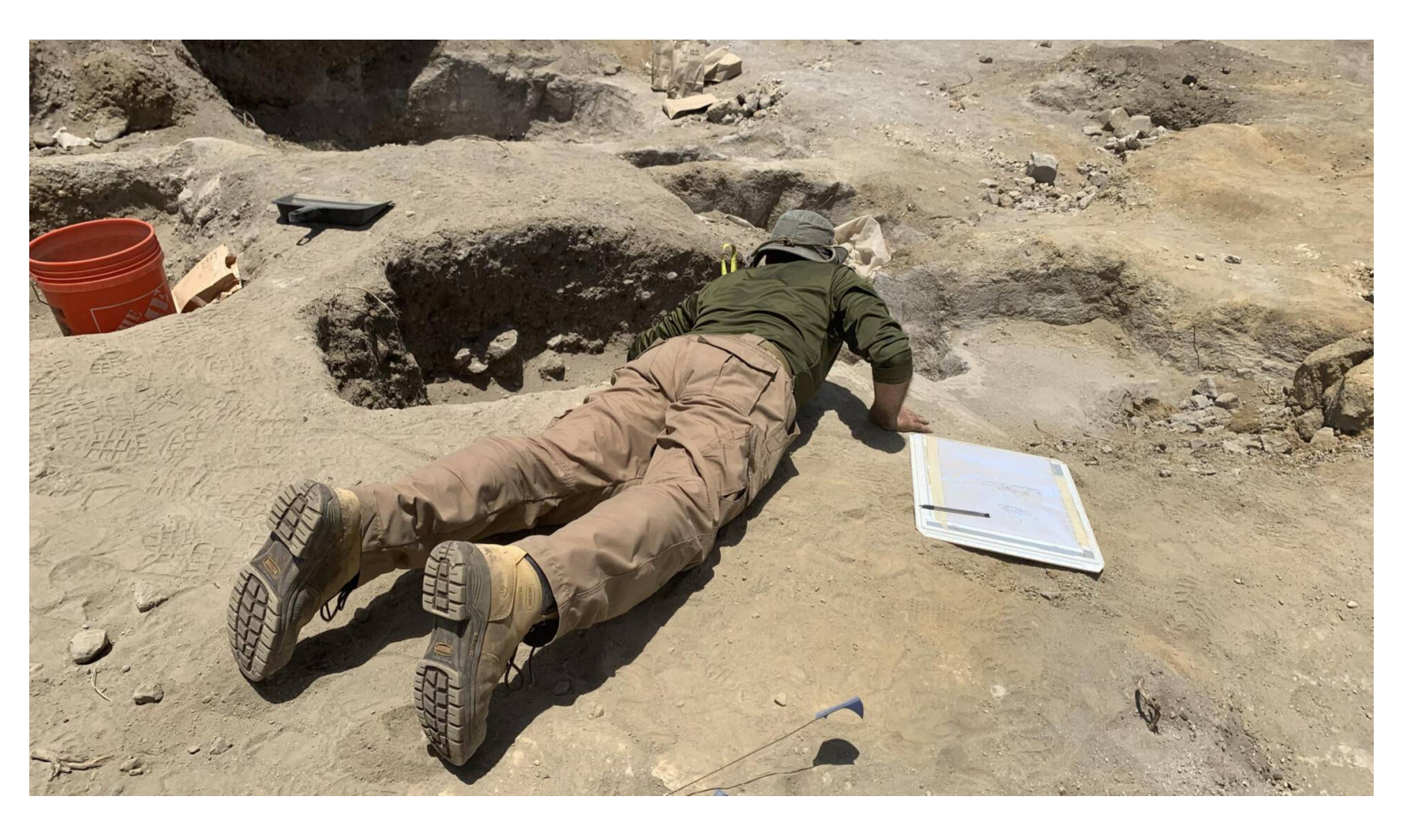
NOS NEWS • FOREIGN COUNTRY (/NIEUWS/BUITENLAND) • 10/06/2021, 8:18 PM